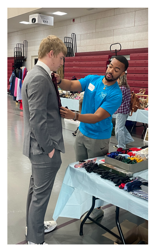
Cinderella and Prince Charming Project boutiques were hosted across the state, allowing high school students to shop for free prom attire and accessories.