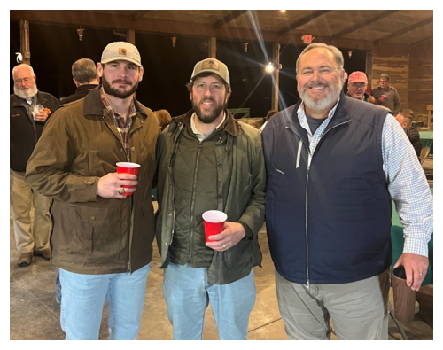
The 6th Circuit Young Lawyers gathered together in December of 2023 to celebrate the holidays!